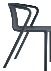
Matt colour Grey Anthracite 1418 C