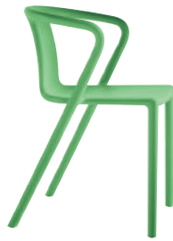
Matt colour Green 1320 C