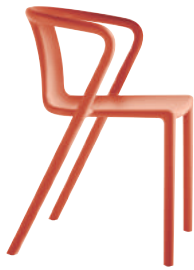
Matt colour Orange 1086 C