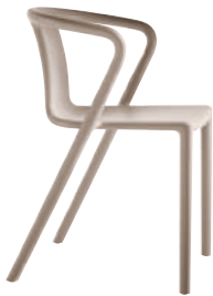
Matt colour Beige 1450 C