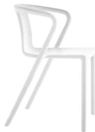
Matt colour Pure White 1690 C