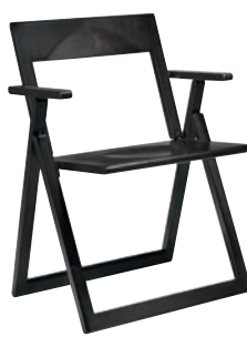
Finish Beech Stained Black