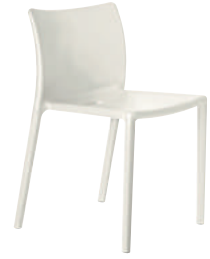
Matt colour White 1730 C