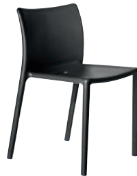
Matt colour Black 1751 C