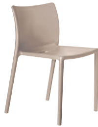
Matt colour Beige 1450 C