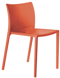
Matt colour Orange 1086 C