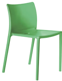
Matt colour Green 1320 C