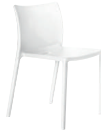
Matt colour Pure White 1690 C